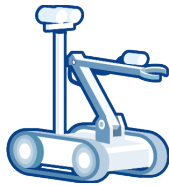
UNCREWED GROUND VEHICLES (UGV)