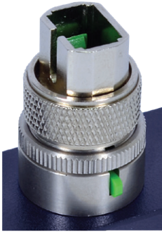
Optical Connector Protector