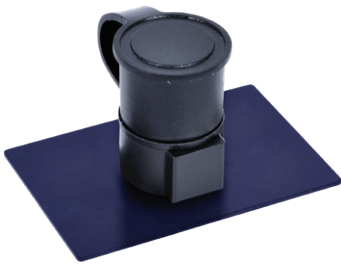
Optical Protector Cover (optional)

1 Patent pending 2 Spare ferrules available in pack of 4 for APC or UPC