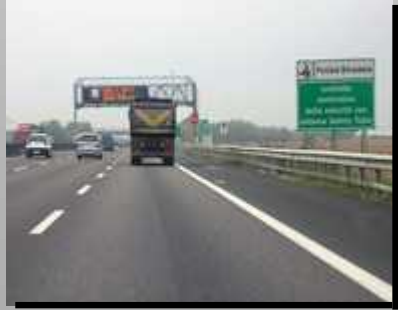
Highway data communications