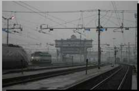
Railway data communications