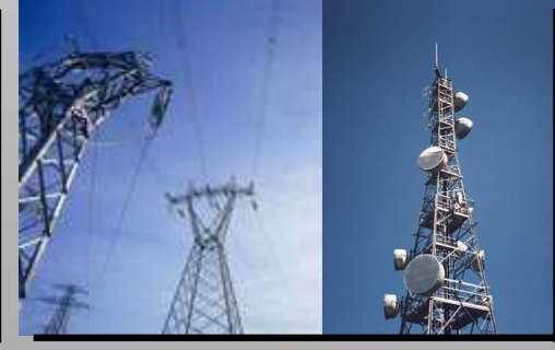
Energy transport data communications