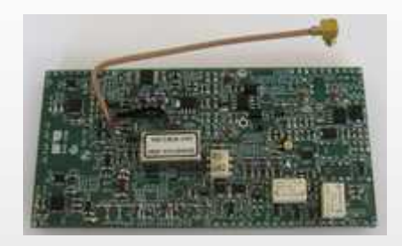
30 MHz Band Expander