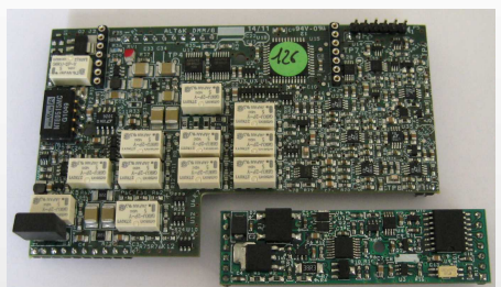
Digital Multimeter and POTS