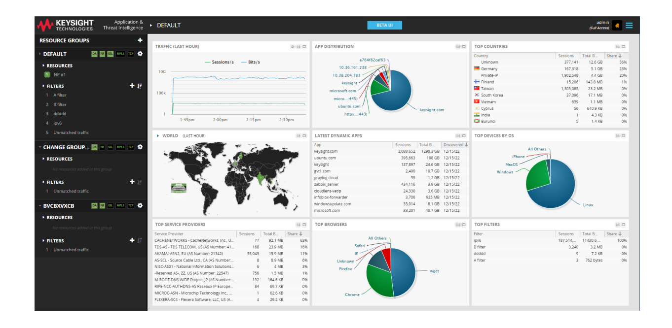
Figure 2. Appstack capabilities