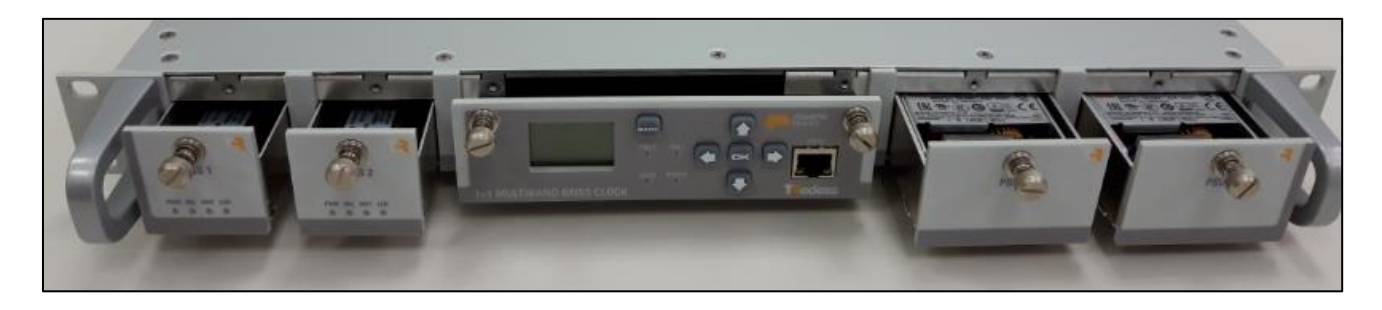
Totally modular solution: Hot-pluggable modules accessible from front panel